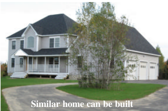
Similar home can be built

Building on the strength of a quality subdivision in a great location, we are proud to offer house lots in the second Phase of Colonial Heights. Situated in Hampden's "four mile square" these lots are only a short distance from town services, schools, the grocery store, post office, Laura Hoit Community Pool, and the municipal office. Public water and sewer service all lots.